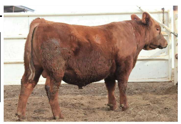
CONSIGNED BY: Gilliam Cattle

Here's a Bieber Spartan son that is sound made, big middled and stout from front to back.