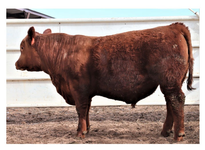
CONSIGNED BY: Gilliam Cattle