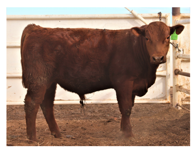
CONSIGNED BY: Triangle G Cattle

Here's a calving ease Fusion son with added marbling and carcass weight.