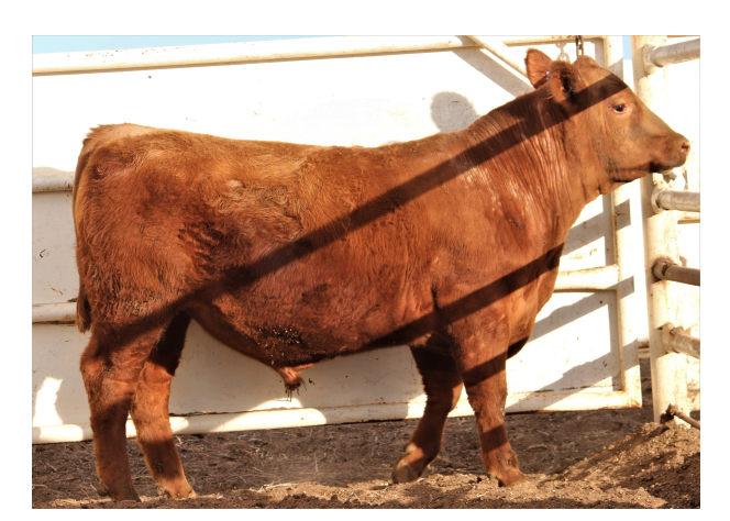
CONSIGNED BY: Gilliam Cattle