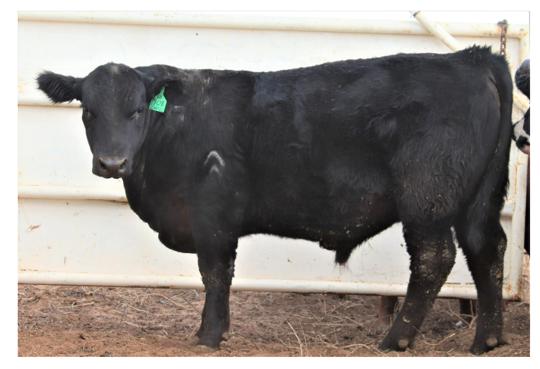
CONSIGNED BY: Gilliam Cattle

Here's another Simmy/Angus Chaps son with Hybred-Vigor for big time growth that should crush the scale at weaning time.