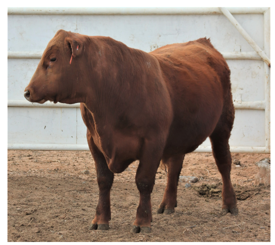
CONSIGNED BY: Gilliam Cattle

LOT 7 TBG No Worries 2100 DOB: 1/20/2021 Reg# 4473603