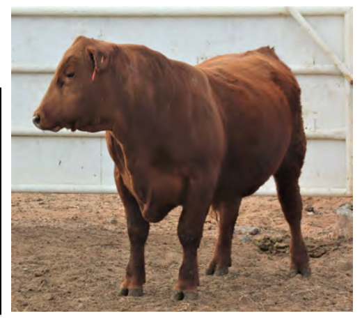
CONSIGNED BY: Gilliam Cattle

Calving ease heifer safe bull that will add more pounds of quality beef on the rail.