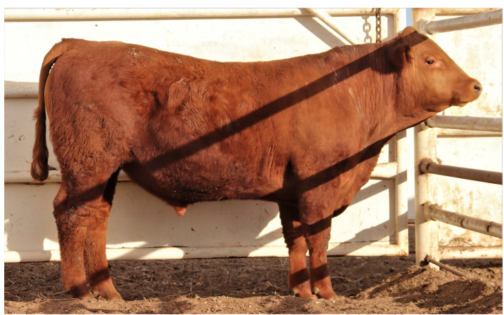
CONSIGNED BY: Gilliam Cattle