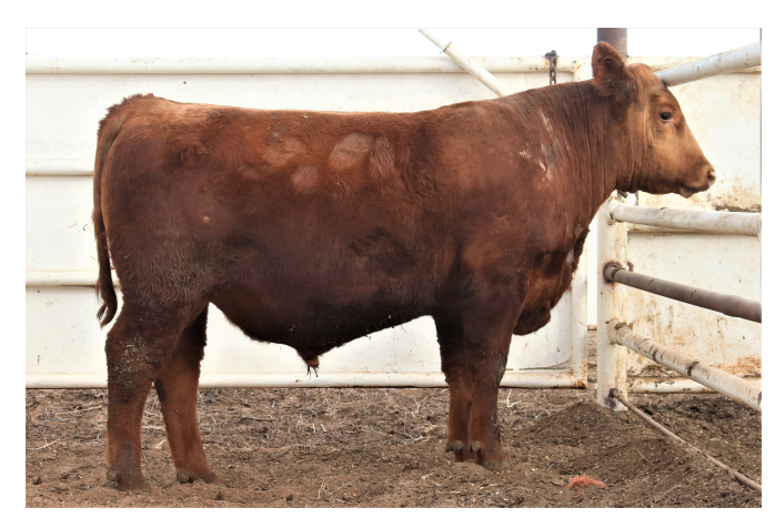
CONSIGNED BY: Triangle G Cattle