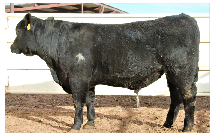
CONSIGNED BY: Gilliam Cattle

Chaps 1702 is a high growth made Simmy/ Angus bull that will add pounds to the scale at weaning.